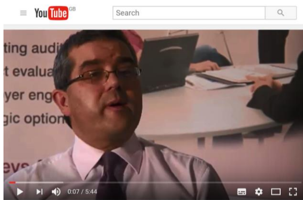
10 Step Guide to Questionnaire Design by RCU

10 Steps Guide to Questionnaire Design by RCU.